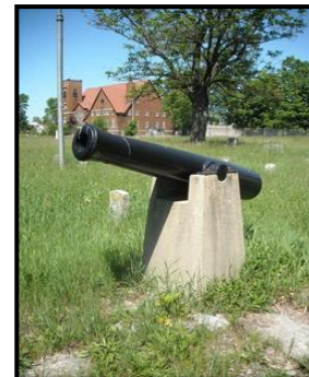
A fake cannon stands today where once was located "The Dictator," a Dayton, Ohio GAR Post's 13-inch seacoast mortar with cairn of shells. The mortar was loaned in 1898 to the GAR Post by the U.S. Navy for use as a Civil War veterans memorial. In 1998 it was sold by the cemetery to a collector's private Civil War artillery museum in Pennsylvania.

Unfortunately, there are no federal statutes to protect cannons located in private cemeteries. And, there is no state law in Ohio to do so.